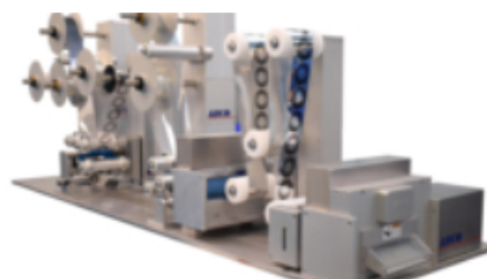
Machinery & Machining Tools New Laminator and Cut-to-length System with Operator Control Panel