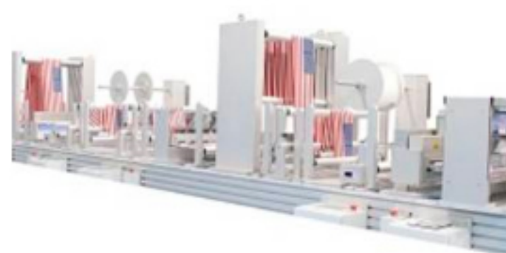
Machinery & Machining Tools AZCO'S Building Blocks of Automation with SMARTFRAME Technology